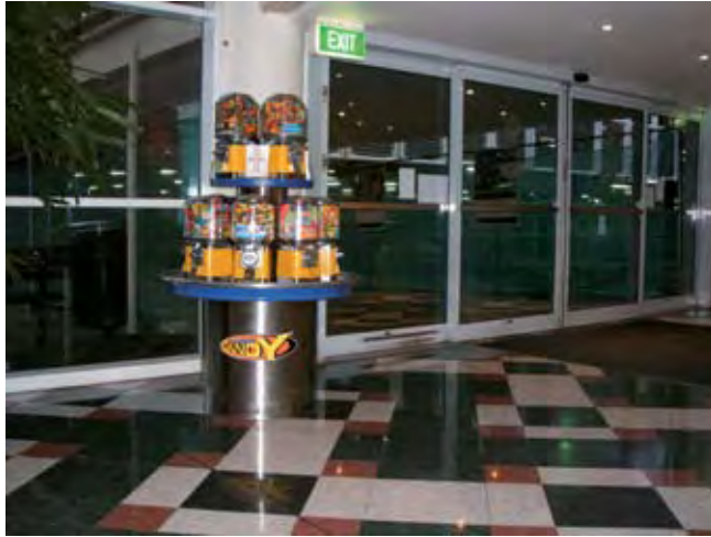
— Column Placement